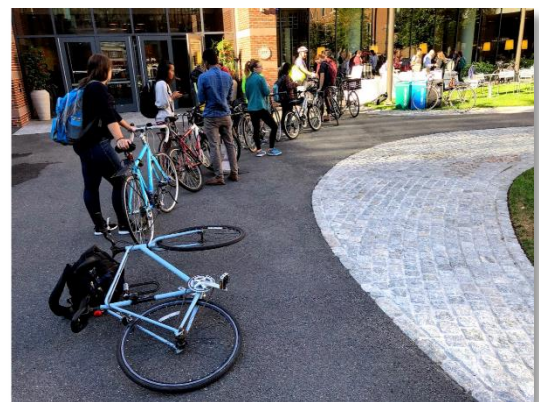
Pop-up safety checks at the Kennedy School. September 5, 2019.