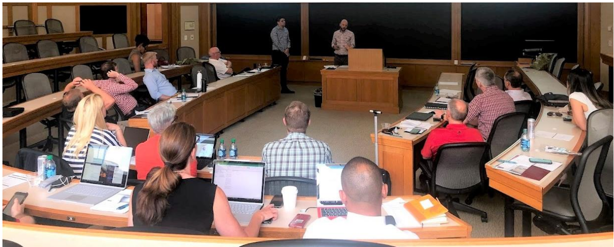
Harvard Transportation Services hosted the annual Ivy+ Transportation Conference at Harvard Law School from June 22 – June 25, 2019. The event brought together transportation executives from ten peer institutions to present and discuss topics including fleet electrification, autonomous vehicles, change management, and innovations in sustainable mobility.